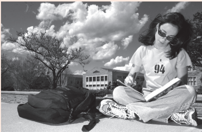
University of Tulsa